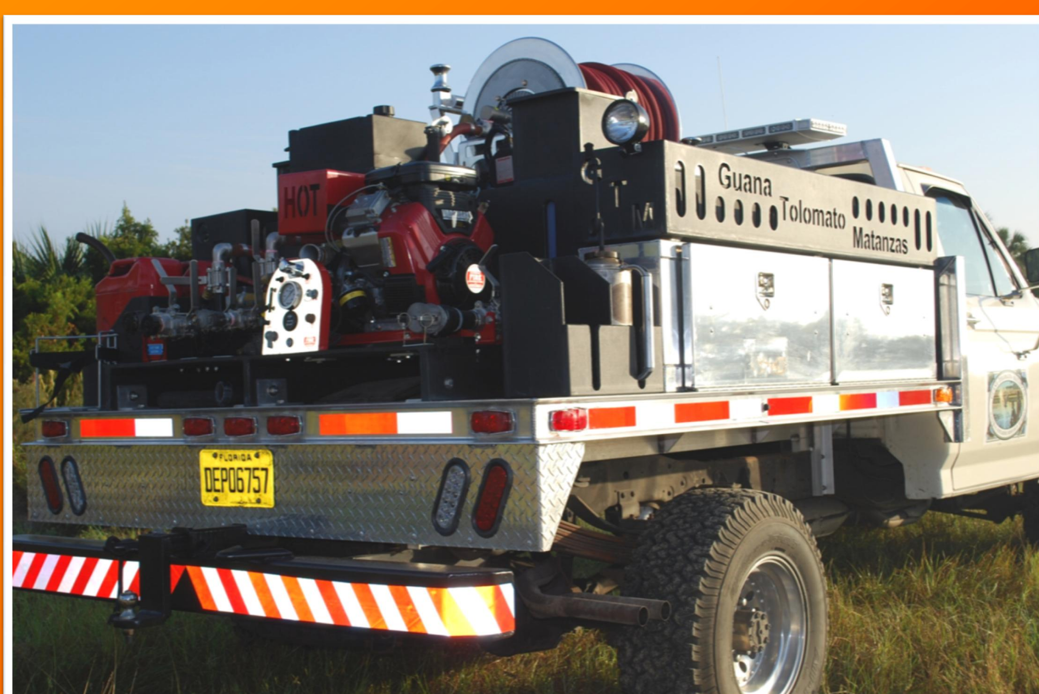
GTM's 270 gallon pumper unit