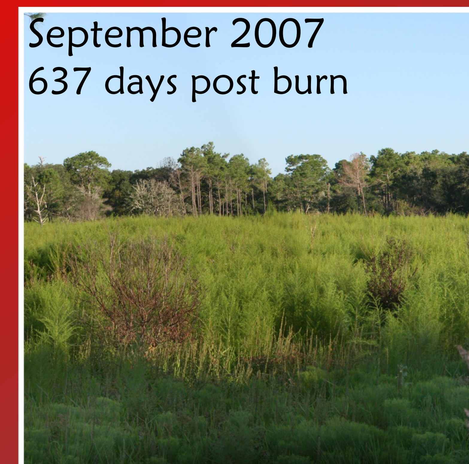
September 2007 637 days post burn