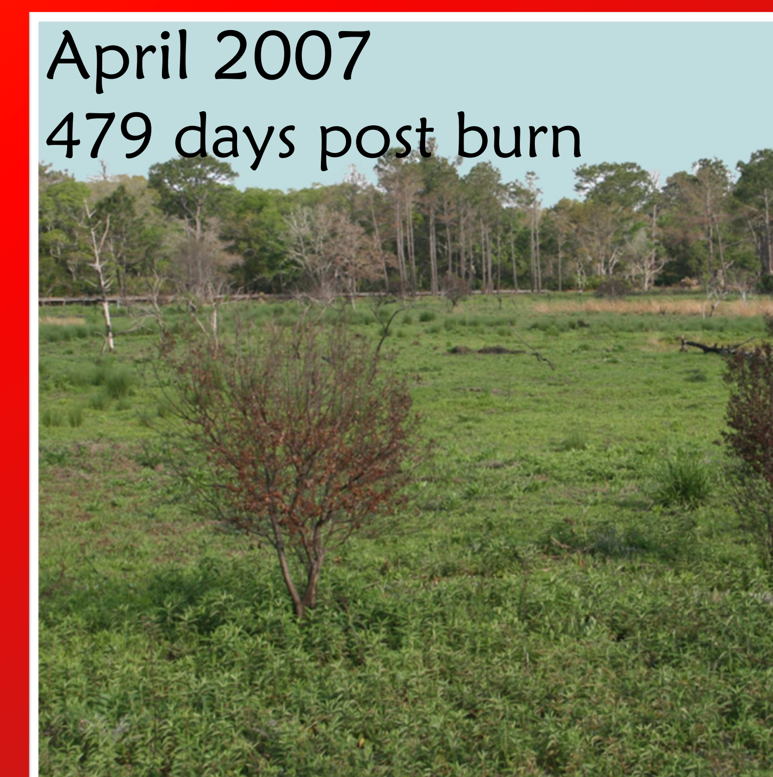
April 2007 479 days post burn