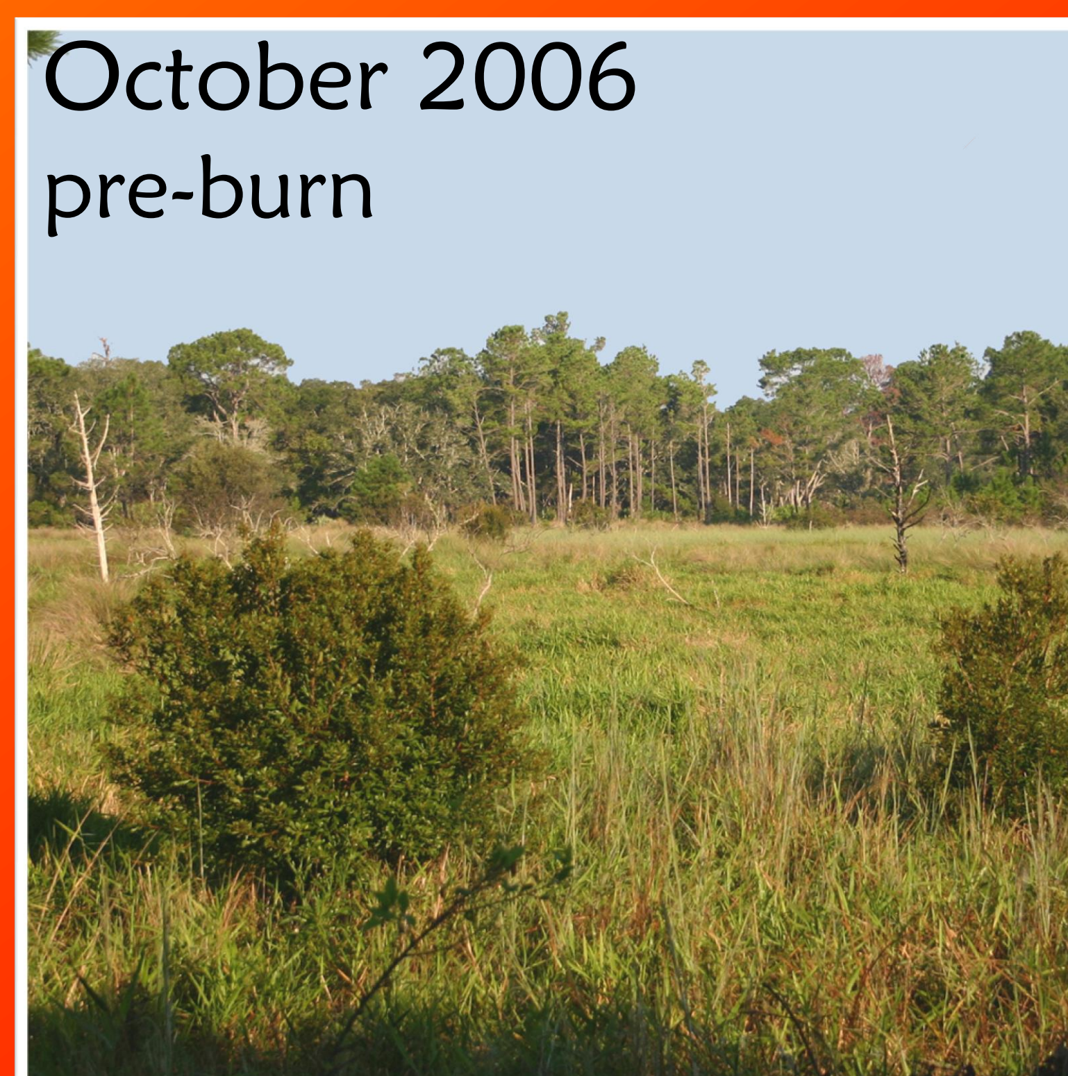
October 2006 pre-burn