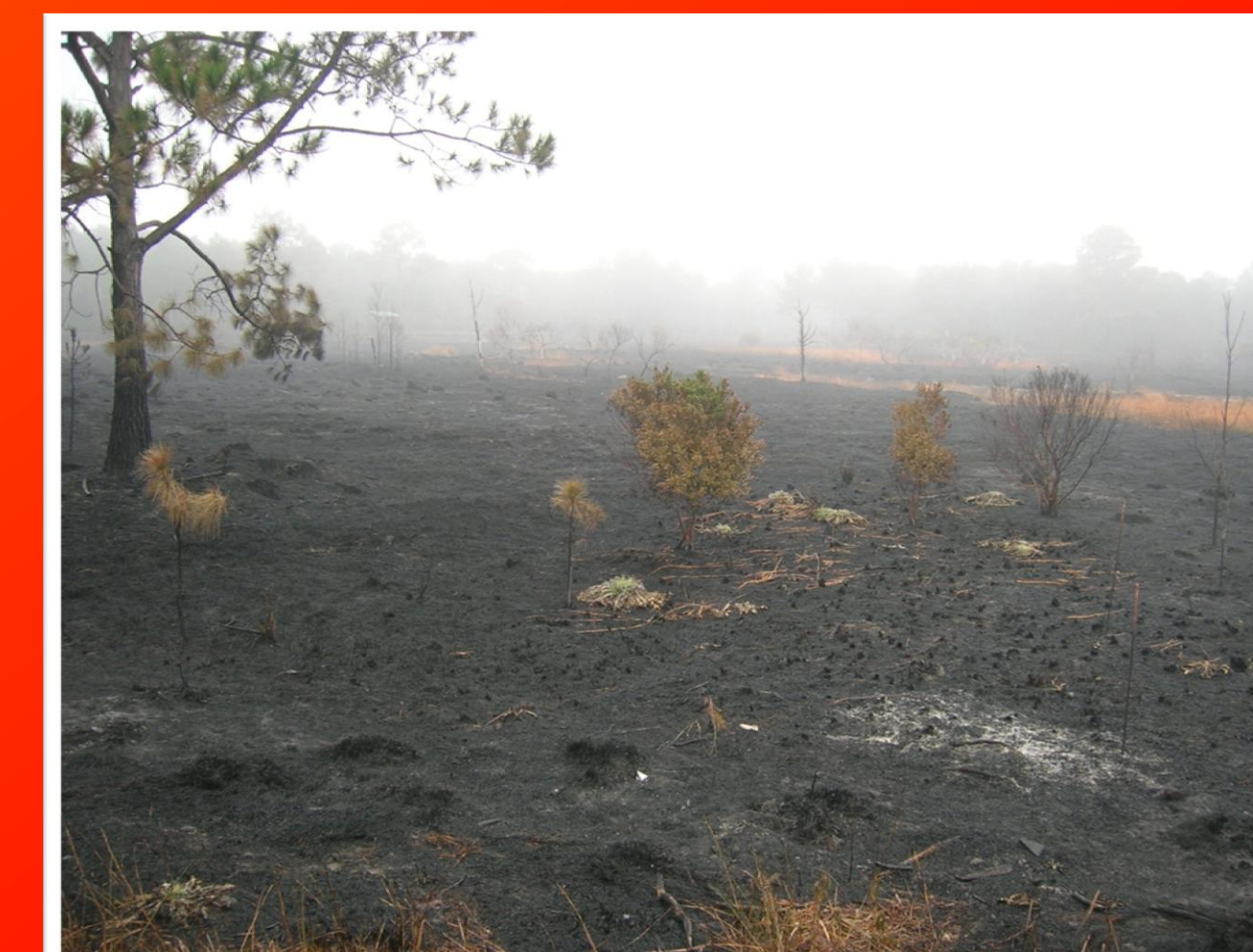
dry freshwater marsh just after prescribed burn

Wildfires naturally occur in Florida, especially during the summer due to lightning strikes. Fire is an essential element for the health of fire-adapted plant communities. Development and population growth have necessitated the suppression of wildfires, allowing for an unnatural change in our plant communities.