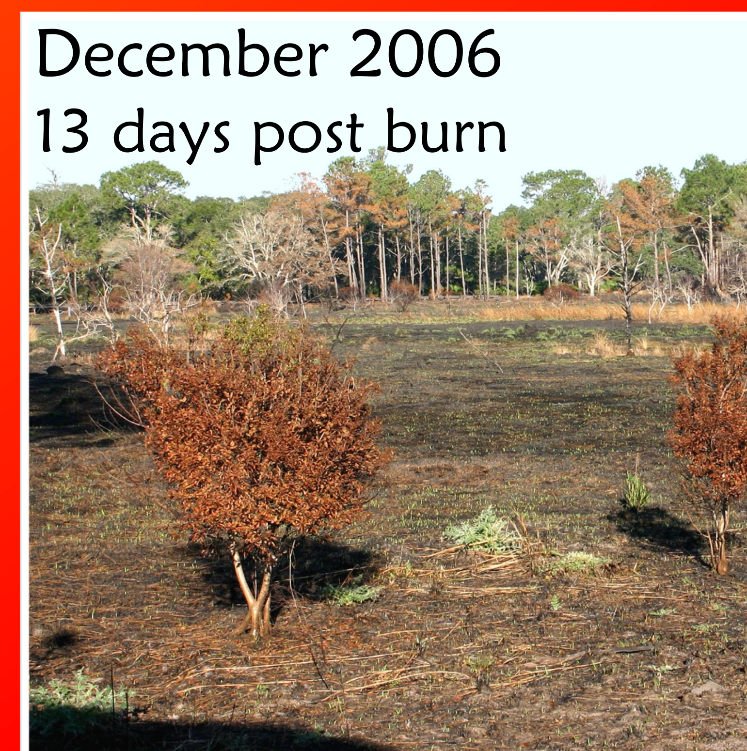
December 2006 13 days post burn